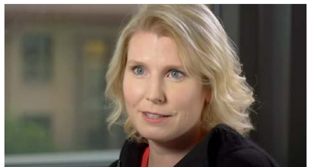
Networking Minds for Open Innovation