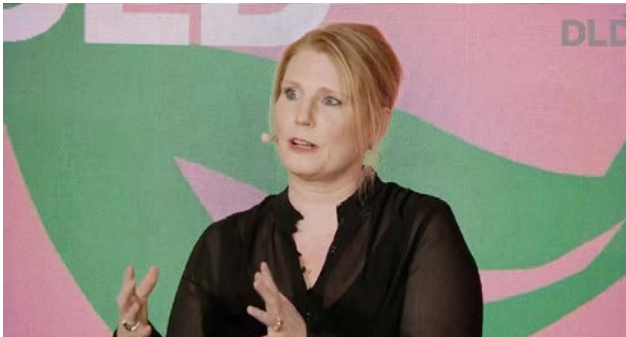
A Call for Human-Centered AI