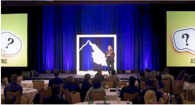
The Power of Curiosity