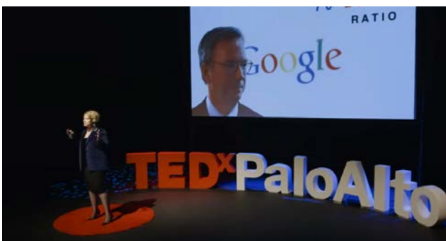
The Secret of How to Think Like an Entrepreneur