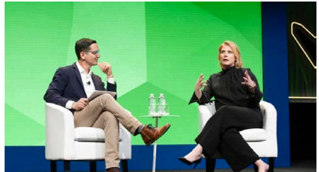
The Essential Skills of Extraordinary Entrepreneurs