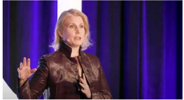
How Profitable Companies Leverage Diverse Mindsets